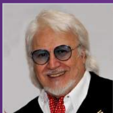
Salvatore Fodera OMC World President

The work presented on the championship must reflect the inspiration images shown on the Inspiration Guidelines Brochure.