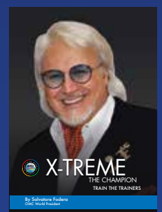
OMC X-TREME The Champion Book ▶