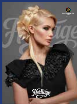
Access to OMC Prestige Club Collections ▶